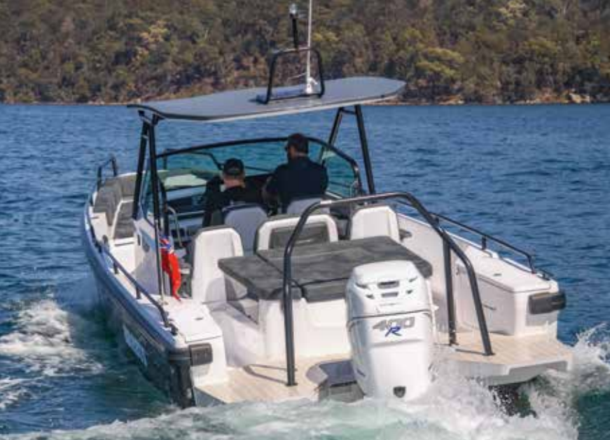
Above: Transom sunbed for two.