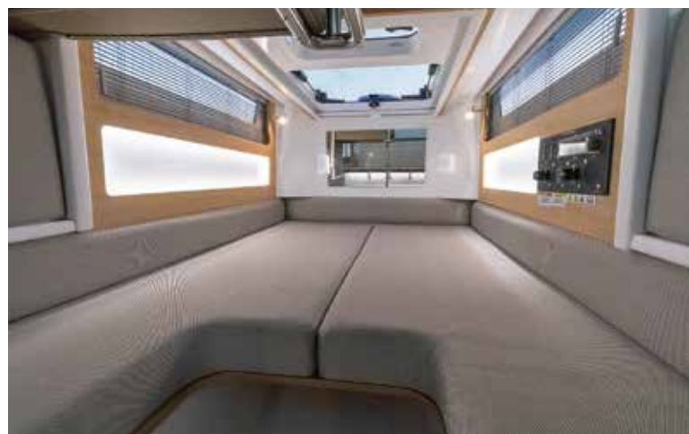
Below: Under the transom sunbed is a two-person cabin.

position and seating arrangement enhance the sports-car-like manner of this boat, with separate helm and passenger seats situated ahead of bench-style seating for three or possibly four people. Crew are protected by a large raked windscreen which is decentred, allowing full view through the curves and the frameless corners without distortion.