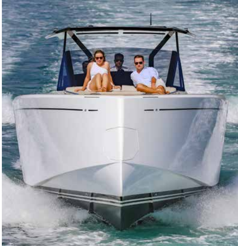
Above: Skipper has good vision through the swept-back windscreen even with passengers reclining on the forward sunbed.