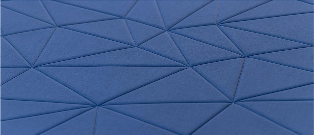
Above – Linetex Sphere