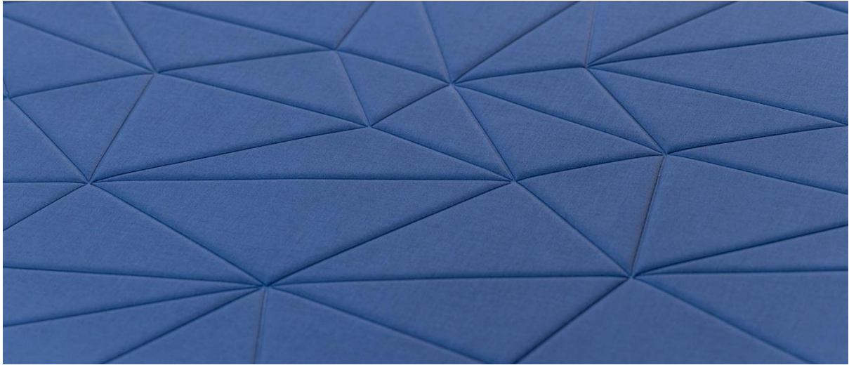
Above – Linetex Sphere