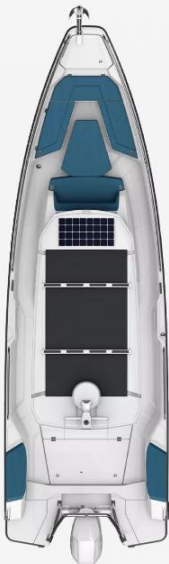
Open Aft with optional U-Sofa and Forward Facing Sun Pad in the bow