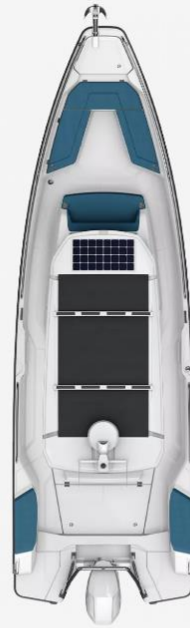
Wet Bar with optional U-Sofa layout in the bow