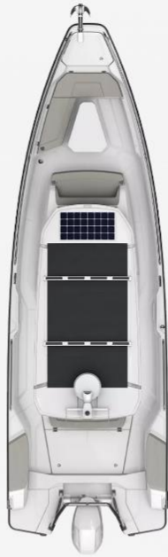
Aft Deck Bench with standard L-Sofa layout and optional Table in the bow

We want to provide you an extensively customizable and user-friendly boat that can match you in your everyday needs all year around and for all your adventures. The configuration you choose will define the final layout of your boat. Below are a few examples of exterior and interior layouts available.