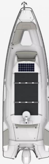
Aft bench with L-Sofa layout and Table in the bow