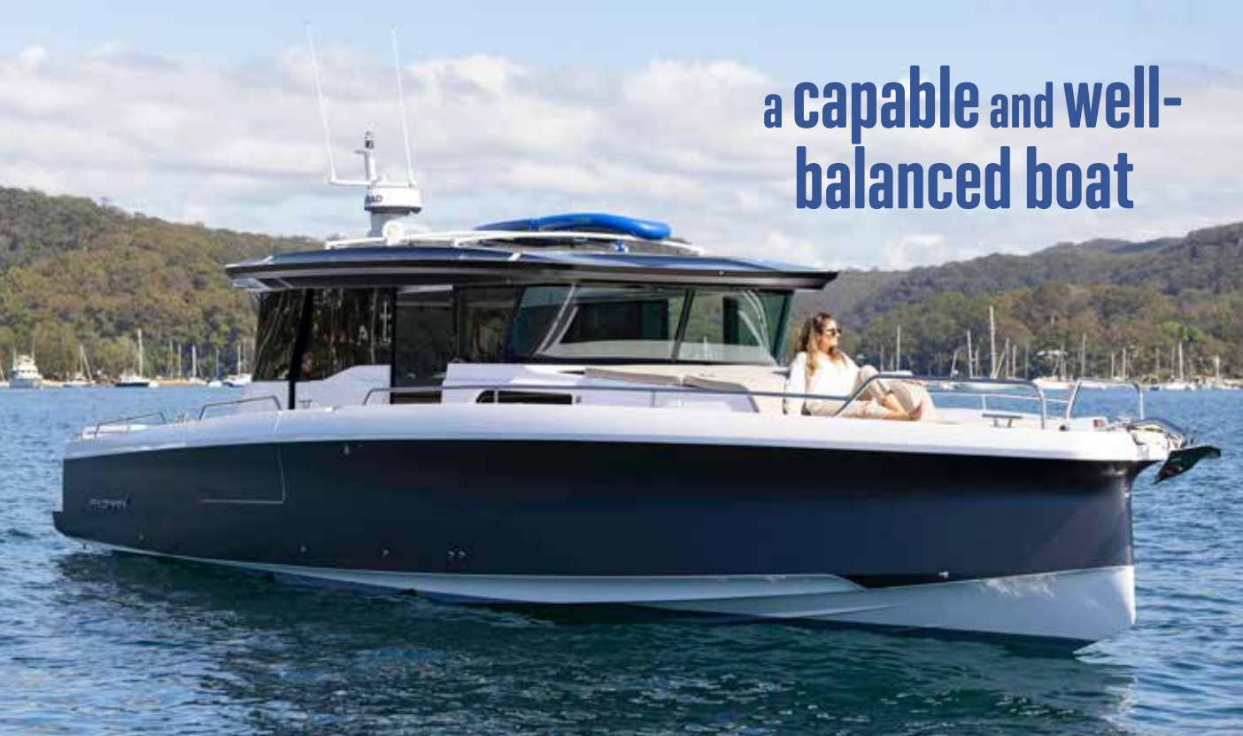
Above: The Axopar 45 XC makes the most of its outdoor spaces.