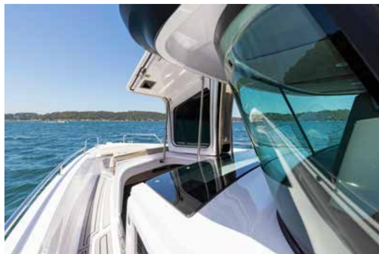
Below: Gullwing doors provide easy access and ventilation to the front cabin.

The Axopar 45 Cross Cabin is a bold new entry into the 45ft cruiser market, combining outdoor versatility with essential indoor comforts.